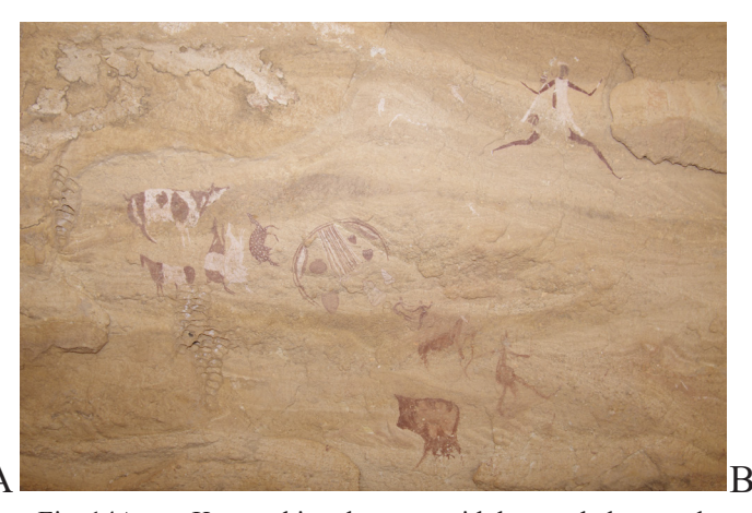
Fig. 14A. — Karnasahi-style scene with hut or shelter, cattle and human figures (site Enneri Dabbou 06).