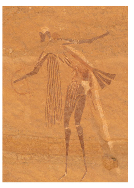
Fig. 10. — Human figure at the main Karnasahi shelter (Karnasahi 00).