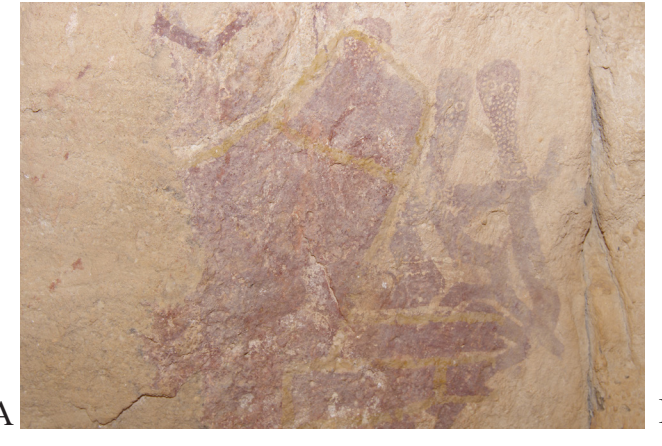
Fig. 3A. — "Korossom Fantastic" human figures showing typical bulbous head and prominent eyes (site Enneri Dabbou 06).