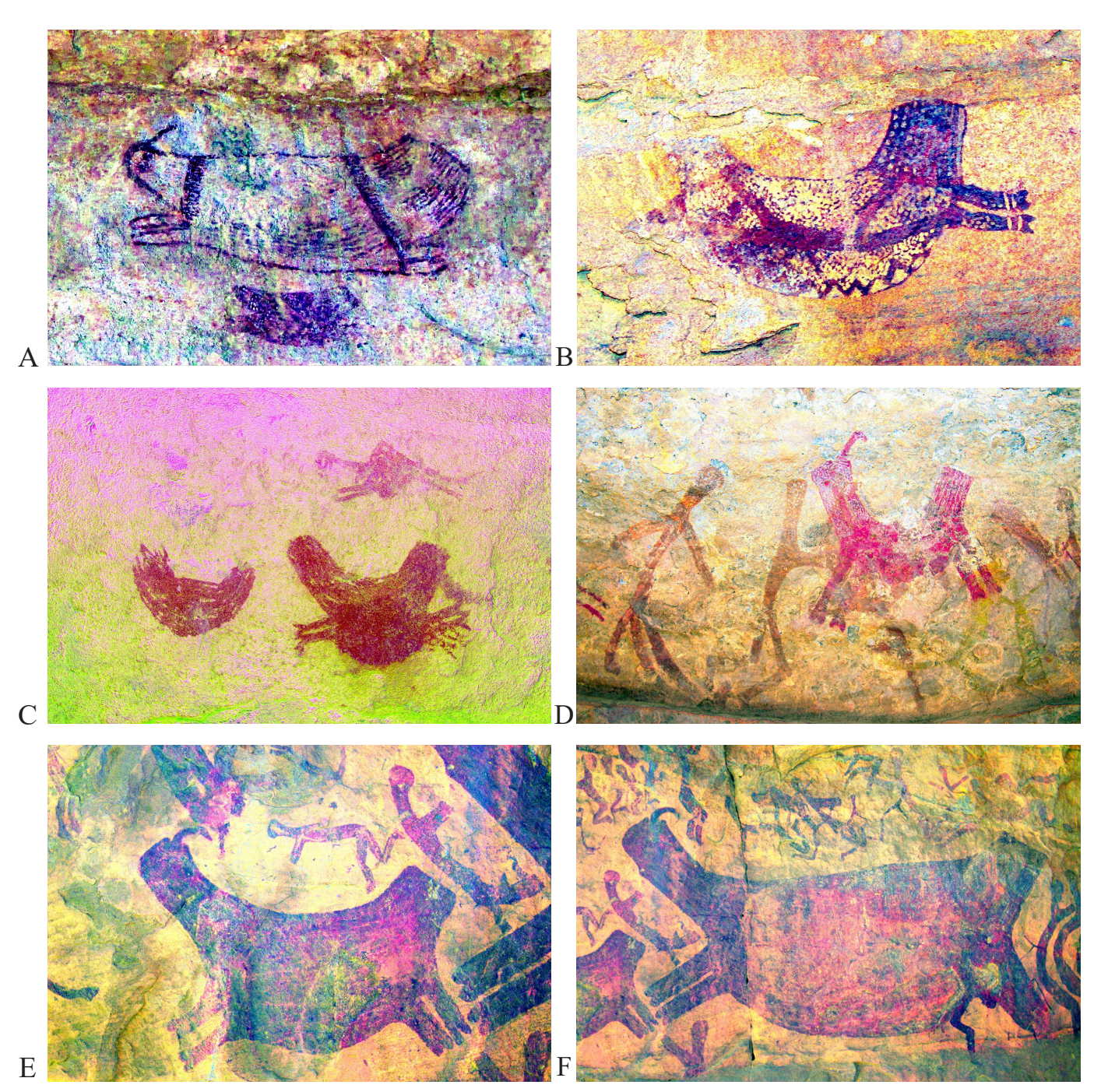
Fig. 7. — Examples of "fantastic beasts" (all images treated with DStretch for clarity): (A) site Korossom North 07; (B) site Teffi Drossou 01; (C) site Korossom North 12; (D) site Korossom North 12; (E) site Karnasahi 06; (F) site Karnasahi 06.