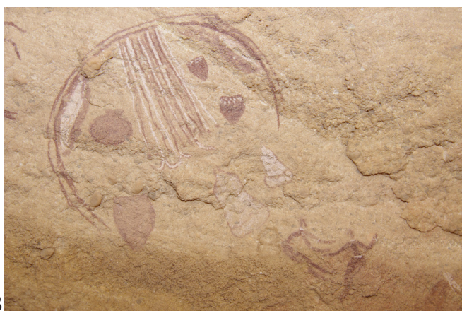
Fig. 14B. — Detail of hut or shelter with utensils hanging from the ceiling.