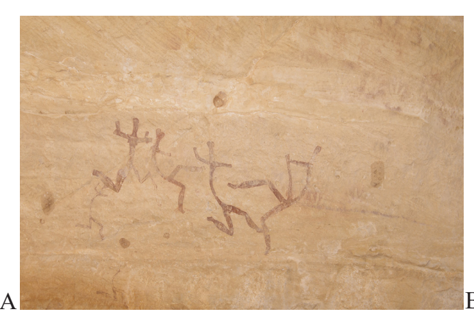
Fig. 8A. — "Korossom Fantastic" figures over a "wallpaper" of negative handprints at Korossom Timmy (site Korossom North 00).