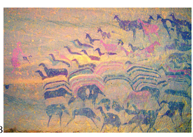
Fig. 12B. — Same image treated with DStretch-YBK filter.