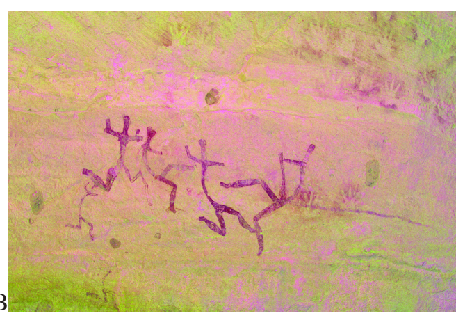
Fig. 8B. — Same image treated with DStretch-YBK filter.