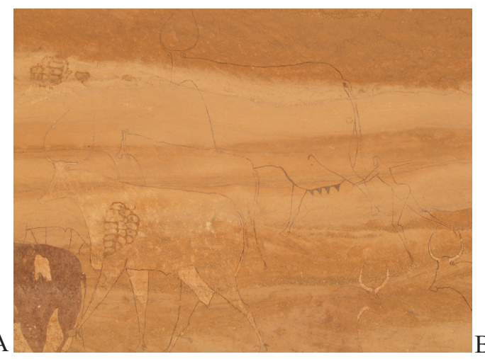
Fig. 13A. — Cattle and humans executed in outline only (site Karnasahi 00).