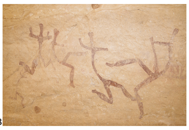
Fig. 4B. — Male and female "Korossom Fantastic" figures at Korossom Timmy (site Korossom North 00). Note consistent difference in body postures.