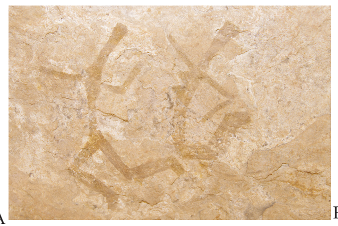
Fig. 4A. — Male and female "Korossom Fantastic" figures (site Korossom North 12).