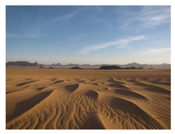
Fig. 2. — The southern Ouri plain at Fofoda.