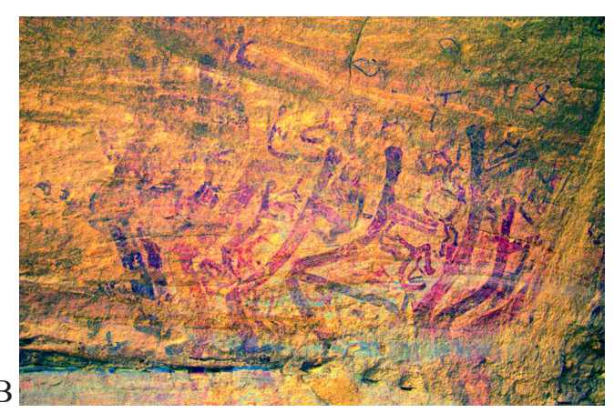
Fig. 5B. — Same image treated with DStretch-YBK filter.