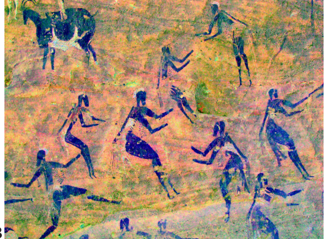
Fig. 11B. — Same image treated with DStretch-YBK filter.