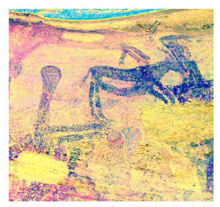
Fig. 6. — "Korossom Fantastic" figure seemingly associated with wild animals (gazelle?, site Fofoda South 07). Image treated with DStretch-YBK filter.