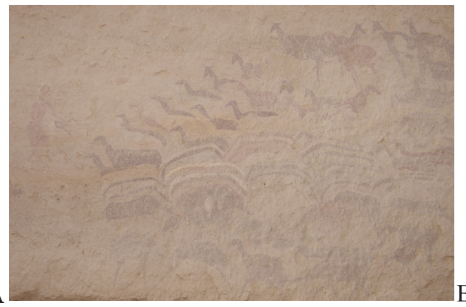
Fig. 12A. — Flock of sheep depicted in a very artistic composition characteristic of the Karnasahi style (site Enneri Dabbou 03).