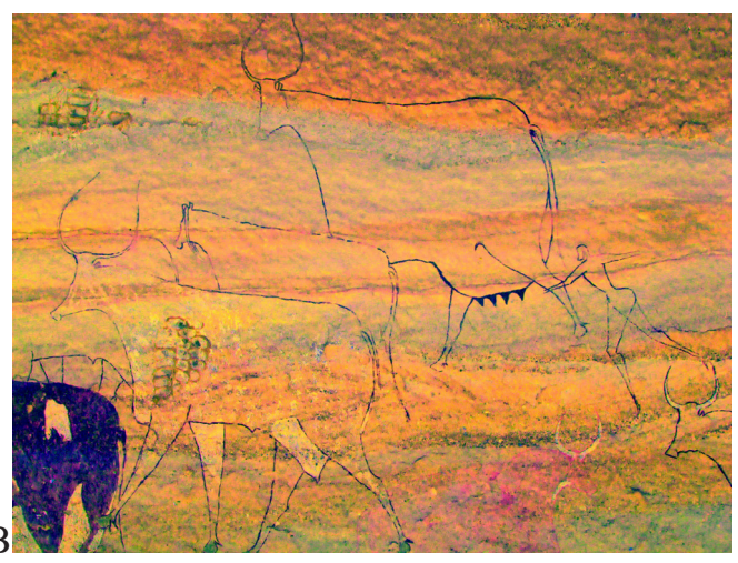
Fig. 13B. — Same image treated with DStretch-YBK filter.