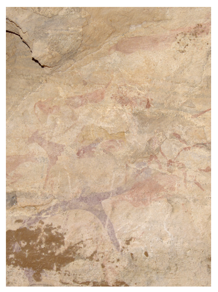
Fig. 9. — Karnasahi-style cattle and human figures superimposed over a "Korossom Fantastic" figure (site Fofoda South 03).