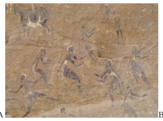
Fig. 11A. — Karnasahi-style human figures (site Fofoda North 01).