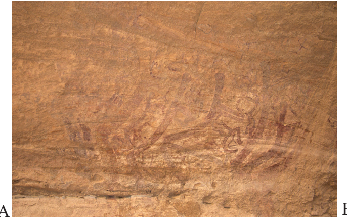
Fig. 5A. — "Korossom Fantastic" human figures exceeding 1 m in height at site Fofoda South 03.