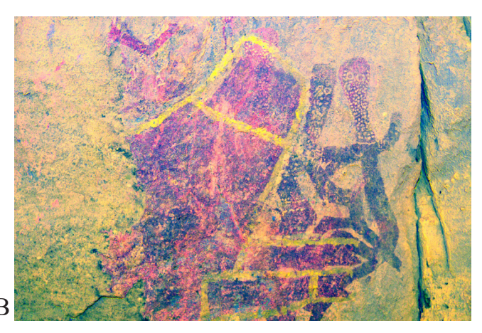
Fig. 3B. — Same image treated with DStretch-YBK filter.